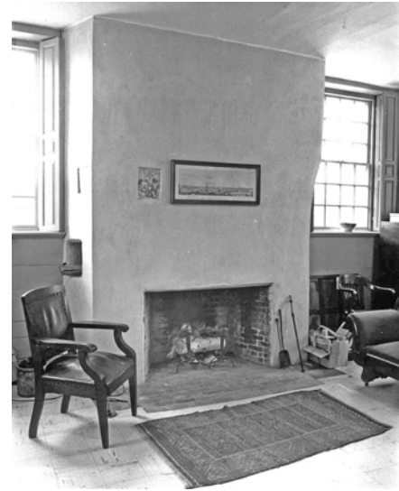
Restored Fireplace, first floor.