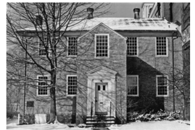
Exterior School House (Post Restoration)

When the building was first occupied by the Providence Preservation Society, it underwent several restorative changes. A fireplace at the west end of the second floor was reopened and the large windows installed during the era of the school for tubercular children were replaced with windows that more accurately reflected the original 18 th century appearance. Among some of the other more notable corrections and changes made to the building were the fitting of all windows with 12 over 12 sash and paneled shutters. 45