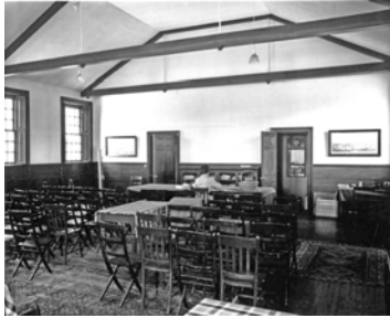
Interior School House (Post Restoration)

originally coated with a varnish glaze of a dark brown tint. The finish was painstakingly reproduced and carefully reapplied to the woodwork, although it has since been painted over. Modernization in the way of updated electrical work and the installation of baseboard heating upstairs also took place 46 .